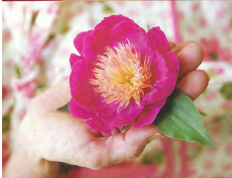
Lian Sui (Rudolf's Salmon Seal)