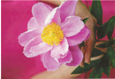
Fen Yu Tu (Pink as a Young Girl)