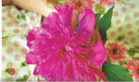
Si Feng Yu (Purple Phoenix Feather)