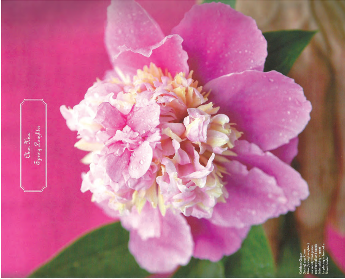
Chun Xiao Spring Laughter