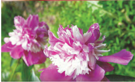
Xiang Jing Gui Xue (Exotic Sunflower)