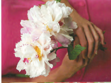
Yan Shi Quan Yu (Range Sprinkled Jade)